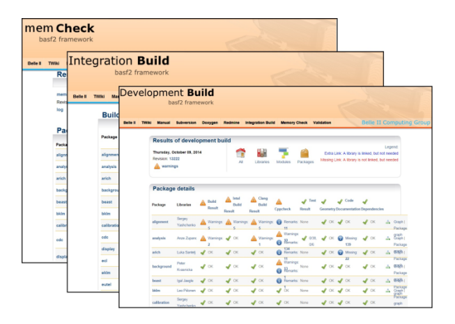
Fig. 1. The screen shots of daily build results. The color scheme of the interface is slightly changed from the original images for better print quality.

External software packages are employed to support development of packages in a more effective way. Software developers are from all around the world. It is important to have a stable and friendly user interface. "Artistic Style" is used to format and check the style of the code [16]. Compilation and linking of basf2 are done by SCons [17], and an automatic Buildbot system is employed to build and test the library on a daily basis during the night [18]. Fig. 1 shows the screen shots of the daily build results as an example. Documentation of basf2 is handled by Doxygen and TWiki [19-20]. Redmine is used to track important issues and problems by software handlers [21].